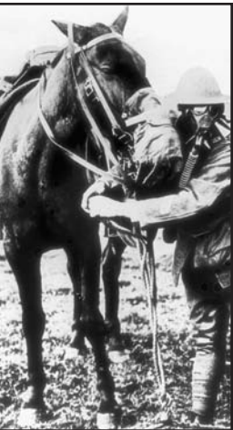
No other animal in the annals of human history and civilization has played a greater role than the horse. Above: a war horse dons a gas mask along with his soldier during World War II.

No other animal in human history has had the effect on our lives as much as the horse. It has fought our wars, transported our goods and our mail, mined our coal, logged our forests, built our railroads, plowed our fields, and overall built—as well as conquered—nations around the globe. And, in many parts of the world, the horse is still conquering and building nations. We owe a special debt to this animal.