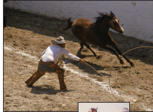
Above: a horse is lassoed by his front legs in a Mexican horse-tripping rodeo.

What few horse enthusiasts know is that thousands of horses are slaughtered in America for the food trade in